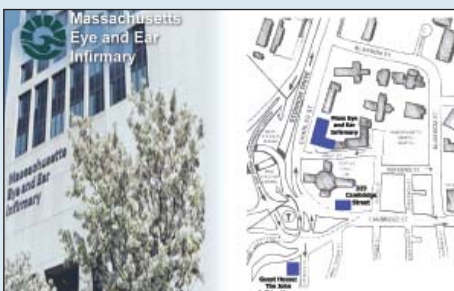
CyberStation Home Page with aerial view of MEEI's campus