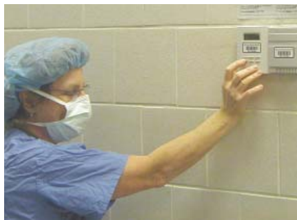
The Smart Sensor provides medical staff a convenient way to adjust room temperatures.

"One of the security department's challenges at MEEI is its diverse list of responsibilities," adds Beaudry. "The future plan is to include web access, so that security personnel on the move will be able to have immediate access to the TAC access/security system."