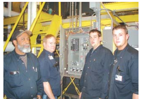
MEEI's HVAC Technicians standing next to a Continuum BACnet control panel