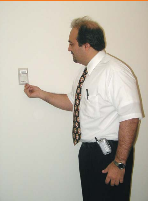
The Smart Sensor provides facilities staff a convenient way to adjust room temperatures.